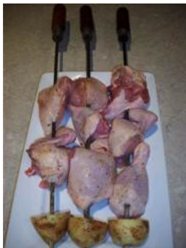
Skewered pieces of chicken on the bone with potato pieces for heat shields ready for cooking