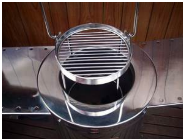
Stainless steel bbq grill being lowered into Tandoor using “U” ends of the naan rods

A great advantage of Tandoor cooking is that your food is cooked without lying in any fat whatsoever!