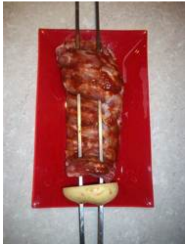
2 skewers being used to secure pork ribs ready for cooking

www.PuriTandoors.co.uk / www.PuriTandoors.com / www.PuriTandoors.ca