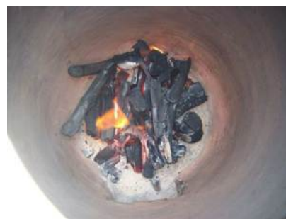
Flames still present after 15-20 minutes