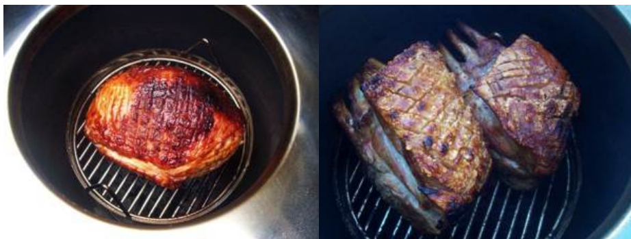
A turkey breast roll & racks of pork cooking on grill in PURI Tandoor