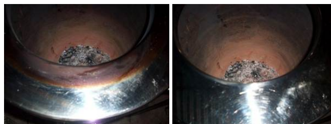
Mouth of Tandoor with cooking residues , cleaned with stainless steel cleaning solution

Stainless steel sections of your tandoor that get hot (e.g the lid) may also develop a pale-yellow colour that does not come off with standard cleaning agents. You can revive the silver finish of the stainless steel simply by wiping the affected regions with solution made from 1-part white vinegar and 1 part salt (by volume). No scrubbing is need - just apply gently, leave for a few minutes then wipe clean with a fresh damp cloth (remove all residues as this is an acidic solution that can promote rust of the stainless steel). You will be amazed how effective this cleaning solution is! See a picture of a heat yellowed piece of stainless steel where only half of it (the right side) has been treated. Cooking residues built up at mouth of Tandoor