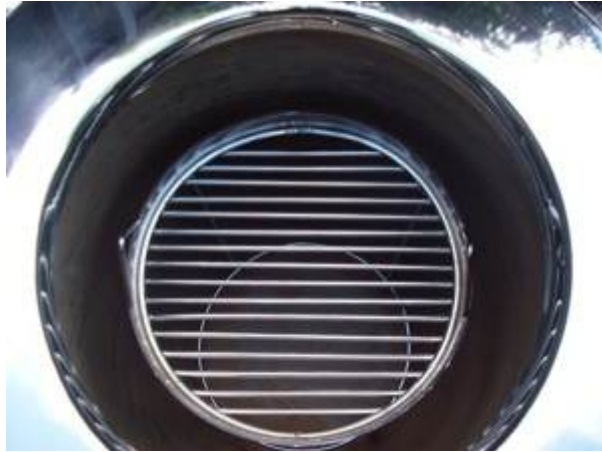
BBQ grill positioned in the tandoor

www.PuriTandoors.co.uk / www.PuriTandoors.com / www.PuriTandoors.ca