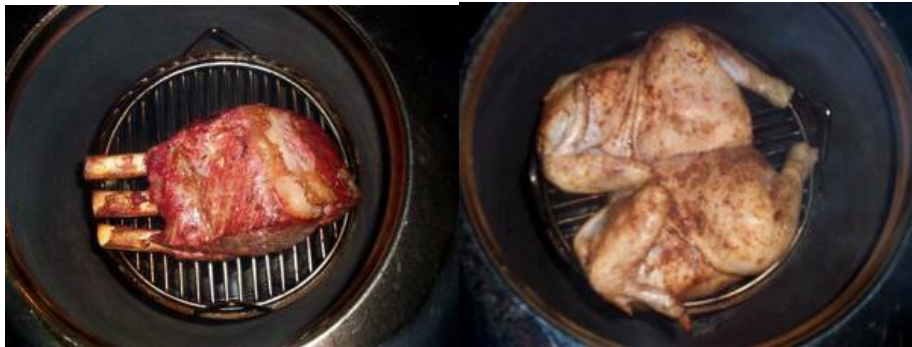
A rib eye fillet & whole chicken cooking on grill in Tandoor