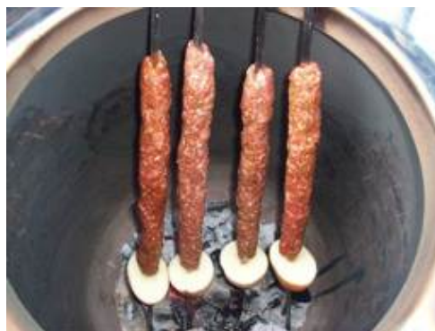
Lamb/ Mutton Seekh kebabs cooking in the Tandoor with potato pieces acting as heat shields