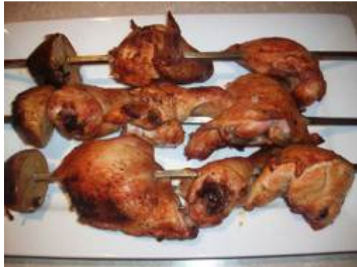
Skewered pieces of char-grilled chicken on the bone cooked in the Tandoor

Tandoori chicken cooking in Tandoor with potato pieces acting as heat shields