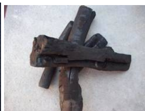
Lump wood charcoal