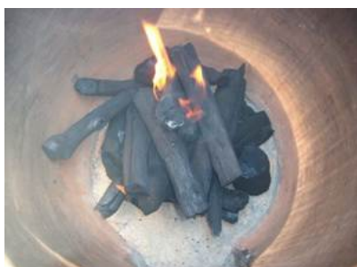
5 mins of lighting the charcoal

For extended period of cooking you can introduce about 1 kg/2lbs of additional fuel per hour, which you can add in portions after the initial batch of fuel starts to lose heat (typically about 1.5-2 hours after lighting the oven). If fuel is added while cooking food, try to add it gradually to avoid flames developing which may burn your food.